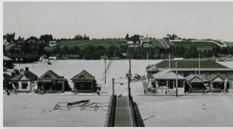
Shotgun houses on the Ocean Park beach, circa 1900.

It is believed that the architectural style was brought to America by Haitian refugees in the early 19th century. They were first built in New Orleans and eventually spread throughout the country. Industries, like petroleum and lumber, favored shotgun houses for their transient workers because they could be quickly and inexpensively assembled, yet were portable and durable. They could be loaded intact on railroad flatcars or reassembled from pieces. They