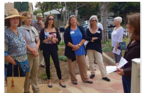
More than 60 members and guests took the tour.