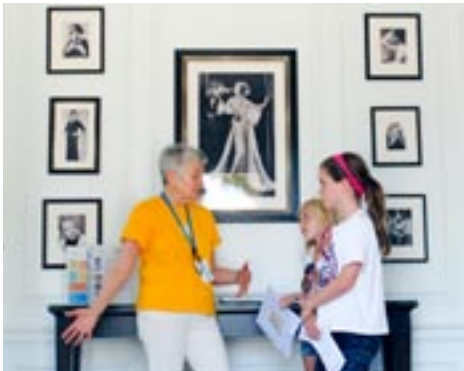
Telling the story of the Beach House

The hands-on “ Building a Neighborhood ” curriculum fulfills State of California standards for social studies and the visual arts. It focuses on the evolution of the Third Street Historic District, giving elementary school students an appreciation for how the story of a community and its residents is reflected in the changing materials, styles, and uses of its buildings. “Building a Neighborhood” has been reviewed in draft form and endorsed by SMMUSD educators and administrators. Achieving our funding goal will make it possible to train and provide classroom teachers with detailed lesson plans, photographs, maps, municipal records, punch-out models of historic houses and a field trip itinerary.