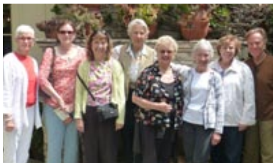
Annenberg Docents at Will Rogers State Historic Park.

The Docent Council continues to have fun and build community while pursuing its continuing education goals; interested Conservancy members are encouraged to consider joining us as docents. Recent highlights of our activities included a trip to Sunnylands (the recently opened Annenberg estate) and the Will Rogers Ranch House in Pacific Palisades.