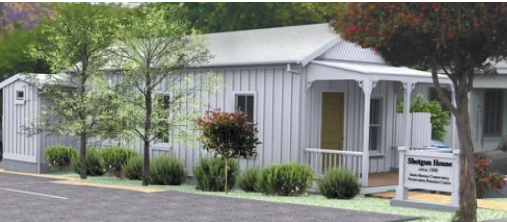
Rendering by Fonda-Bonardi and Hohman, Architects

The Santa Monica Conservancy has completed more than half of a $1.6M fundraising campaign. Attaining this goal will enable the Conservancy to rehabilitate one of the last remaining shotgun houses in the City, locate it in a cluster of historic structures in Ocean Park, open and staff it as a Preservation Resource Center for the community and launch an engaging elementary school curriculum, “Building a Neighborhood.”