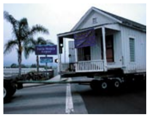
Shotgun House arriving at its temporary home at the Santa Monica Airport in 2002.

According to board member and project architect Mario Fonda-Bonardi, "these costs include removal of non-historical elements, protection and rehabilitation of appropriate interior surfaces, rehabilitation of the porch including replacement of the lost corbels, and new double-hung windows compatible with the one remaining original window." continued on page 6