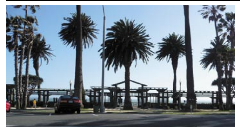
The pergola is one of Palisades Park's best-known features and is used in the logo of the Conservancy.