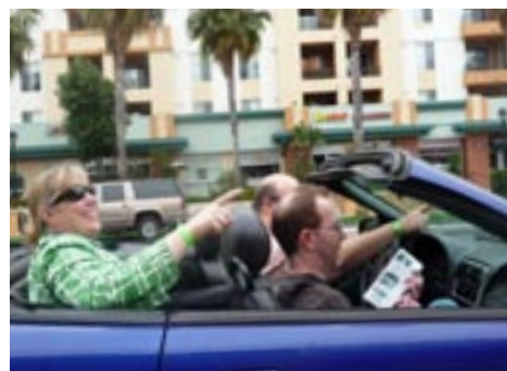
Tour goers set off from the meeting place at Yahoo Center.

The homeowners who graciously shared their gardens were: