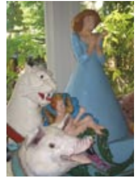
A sample of the delights on display at the King/Knop residence during the exclusive reception.