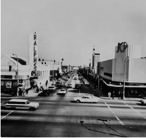
Third Street looking south from Wilshire, 1965, Fred E. Basten Collection, photo courtesy of the Santa Monica Public Library Image Archives.