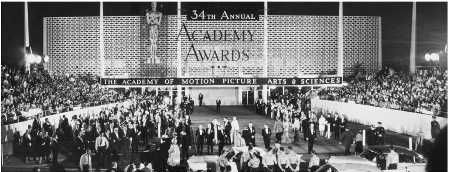
Academy Awards held at the Santa Monica Civic Auditorium, April 17, 1961

Very special birthday wishes to the Santa Monica Civic Auditorium! June 16 marks this City Landmark's 50th year of operation.