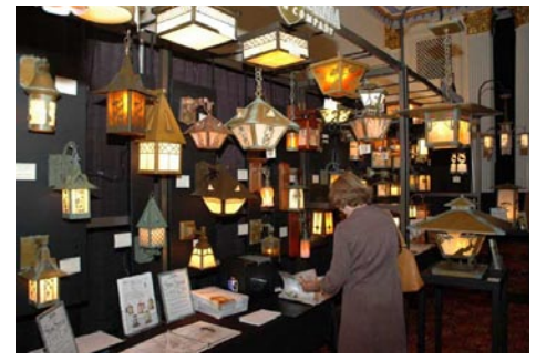
17th Annual Craftsman Weekend October 17-19

Pasadena Heritage 651 South Saint John Avenue Pasadena, California 91105-2913