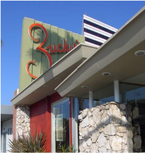
Zucky's

There's new life at the corner of Wilshire Boulevard and Fifth Street in Santa Monica these days. The eye-catching building that