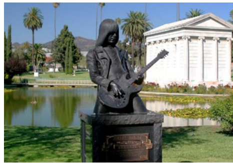
Annual Cemetery Tour at Hollywood Forever October 11, 10:00 a.m. - 2:00 p.m.

http://www.hammer.ucla.edu/exhibitions/139/