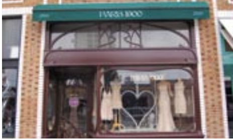
Paris 1900 on Main Street

The Landmarks Commission recently voted to designate the historically viable structures located at 2701-2705 Main Street as a City Landmark in the first of what could be a series of designations of buildings deemed contributors to a potential Main Street historic district.