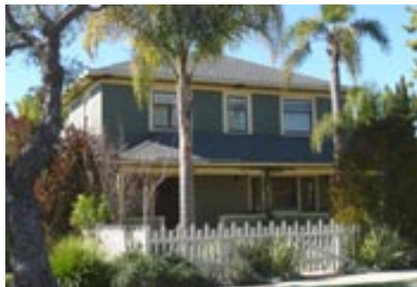
2450 25th Street

moved from its original location at 1140 7th Street to Sunset Park. After their extraordinary