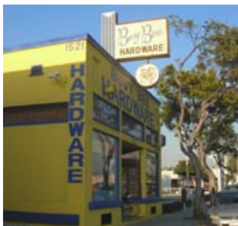
Busy Bee Hardware