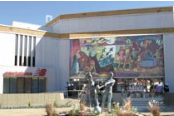
Former Home Savings on Wilshire

The recent city survey of historic resources identified several hundred structures with potential to qualify for Landmark status; the Landmarks Commission is currently considering a number of them. One prominent example is 2600 Wilshire Boulevard, the site of the former Home Savings of America.