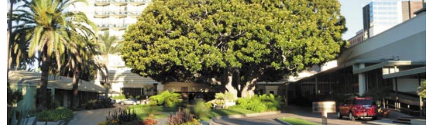
Planning for 2011 California Preservation Conference