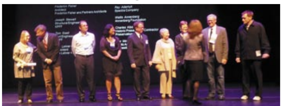
The California Preservation Foundation presented its annual Preservation Design Awards at the Getty Villa on October 16. Once again, the Annenberg Community Beach House was recognized, this time as an outstanding example of Contextual Infill.