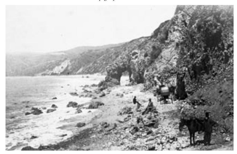
In the early years of Santa Monica on the way to Malibu there was once a landmark known as Arch Rock. This was a unique geological feature you could drive through on a road that was only passable at low tide. To find out what happened to it, see page 5.