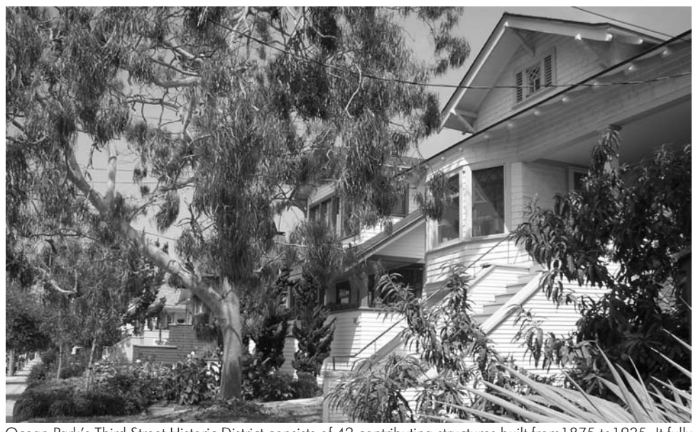
Ocean Park's Third Street Historic District consists of 42 contributing structures built from 1875 to 1935. It fully chronicles the range of architectural development trends for that period.

will be able to attend the event for free. Docents are stationed in various homes to assist participants and answer questions. Docents should contact the Conservancy right away at 310-485-0399 or info@smconservancy.org.