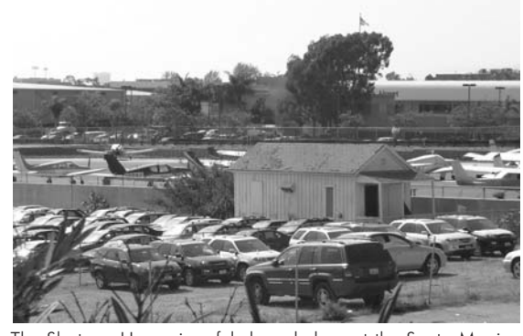
The Shotgun House is safely boarded up at the Santa Monica Airport awaiting a new home.

Recommended relocation sites include the community garden on Nielsen Way and adjacent to the California Heritage Museum on Main Street, both in Ocean Park.