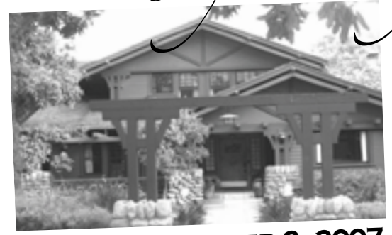
SUNDAY, DECEMBER 2, 2007 3 – 5 p.m. SIEBERT/FRESCO RESIDENCE