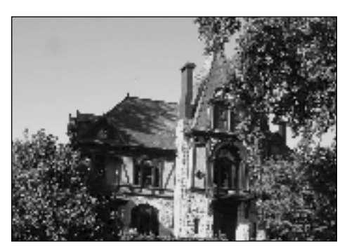
a. Date: April 23-26, 2008 California Preservation Foundation 5 Third St., Ste 424, San Francisco, CA 94103