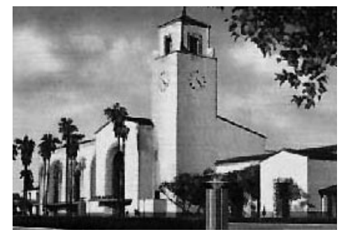
UNION STATION WALKING TOUR Dates: 3rd Saturday every month (4/15 5/20/ 6/17) 10:00 am 800 North Alameda Street, Los Angeles Los Angeles Conservancy