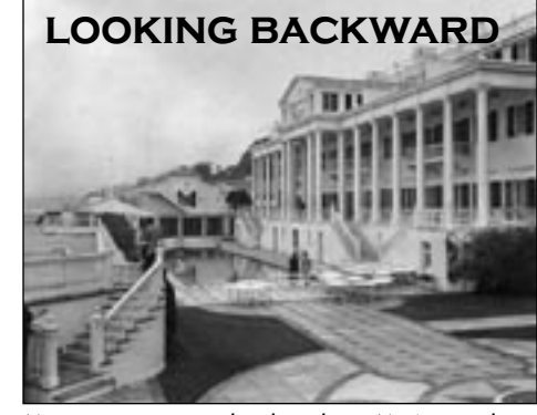
M. Davies Estate in its heyday.