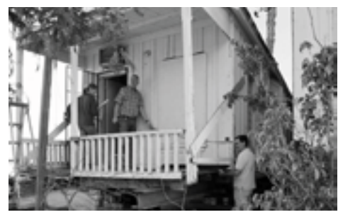
Measuring the shotgun house.