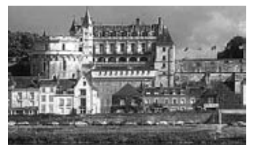
Amboise Chateau in the Loire Valley of France, architectural inspiration for the hotel never built

This postcard depicts a proposed hotel that would have been an addition to the fashionable Gable Beach Club seen in the foreground. With ramparts rising to the top of the cliff and jutting out many levels above Palisades Park, a bridge over the coast highway would have linked it to the beach club. An elegant entrance would have welcomed guests from Ocean Avenue.