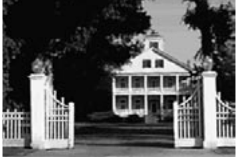
BANNING RESIDENCE Date: Sun., April 23, 11am- 4:00 pm 401 East M Street, Wilmington, CA